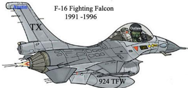
F-16 Fighting Falcon 1991 -1996