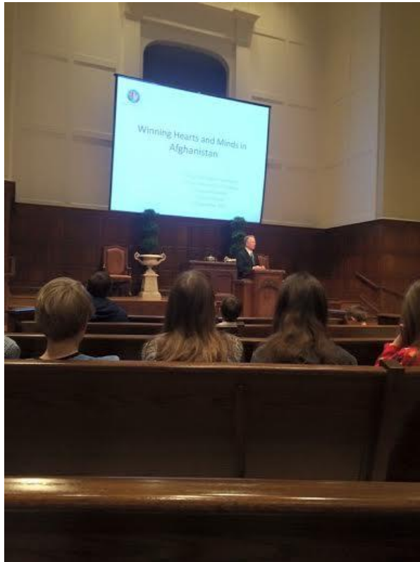
General Bradley at Podium