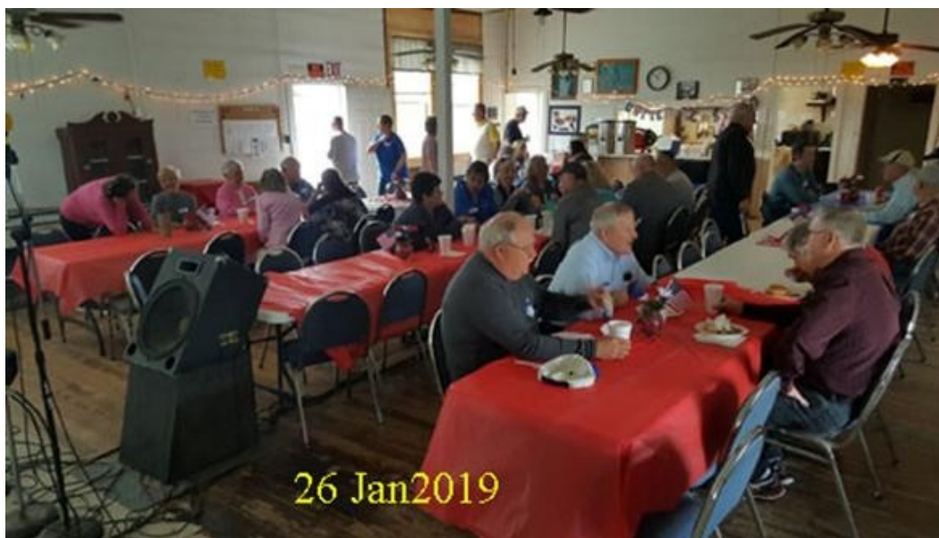
More pictures on Facebook page "924 th TFG"