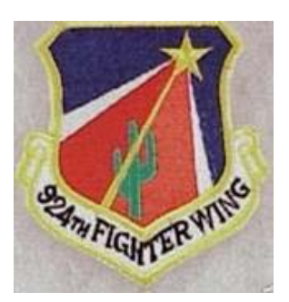
924<sup>th</sup> Air Force Reserve