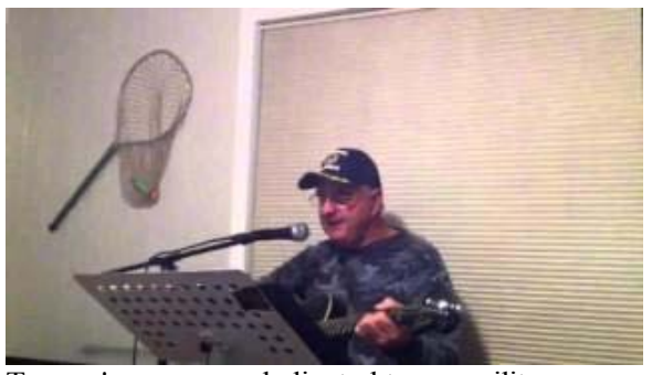
Tommy's new song dedicated to our military. Hope you enjoy!

http://www.youtube.com/watch?v=ieeZgWR2Epo