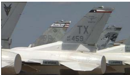
Making F-16 Drones at Boneyard