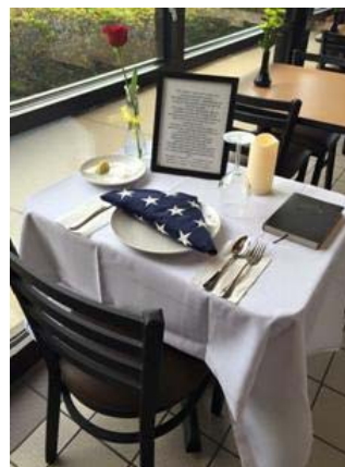
Chick-fil-A in Carrollton, TX May 2016