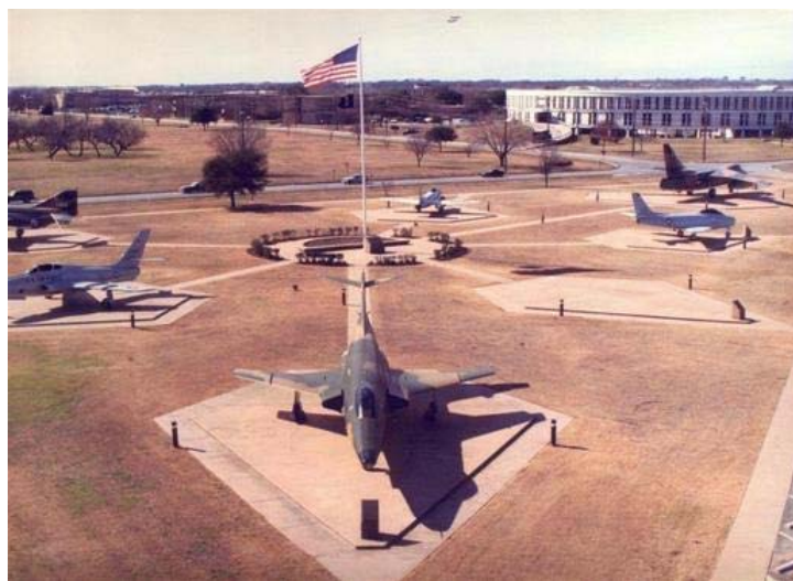
BAFB Airpark 1980