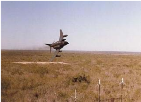
Outlaw low level, at range near Corpus Christi