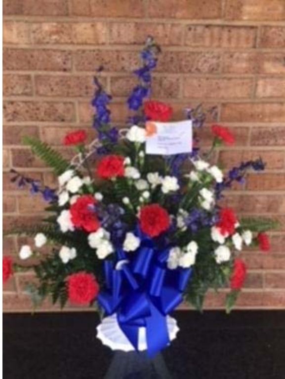
From 924 Flower Fund