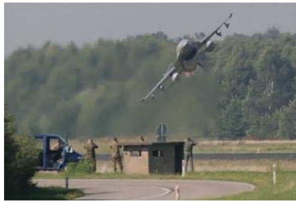
Outlaw low level, at range near Corpus Christi