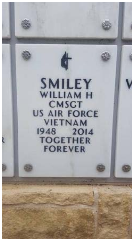
Smiley is also there