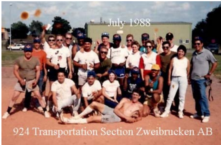
924 Transportation Section Zweibrucken AB