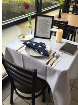
Chick-fil-A in Carrollton, TX May 2016