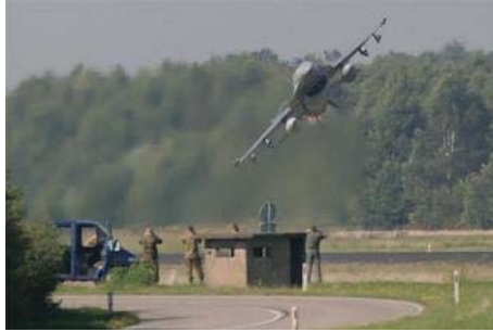
Outlaw low level, at range near Corpus Christi